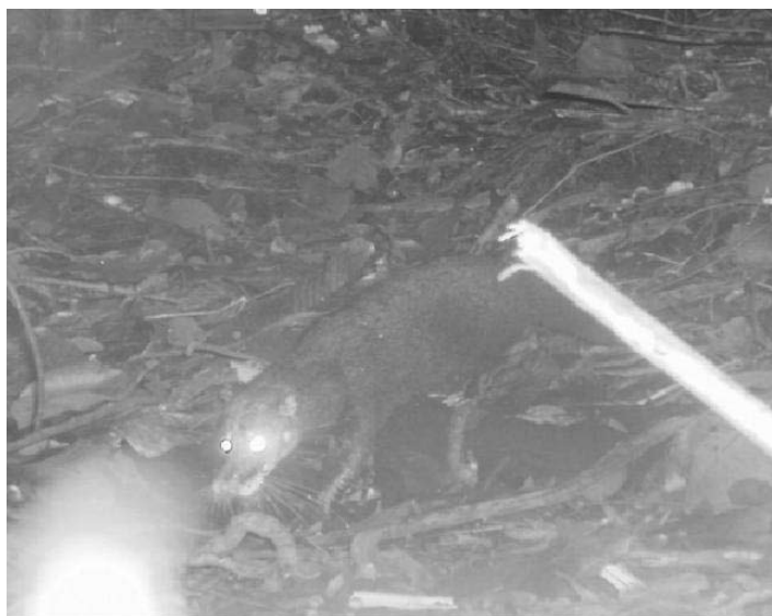
Fig. 2. Otter Civet Cynogale bennettii (A) taken at 02h17 on 3 May 2009 on cameras set about 3 km south of the Setia Alam base camp (2°33'S, 113°89'E) and about 4.5 km south of the Sabangau River; (B) taken at 21h27 on 26 May 2009 on cameras set 3.5 km south-west of the first photo (2°32'S, 113°89'E) and about 2.5 km south of the Sabangau River.