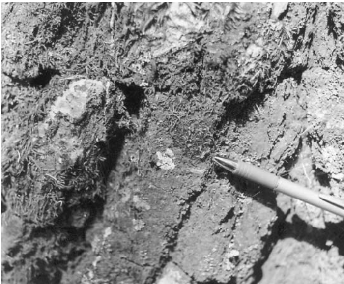
Fig. 2. Perineal gland secretion of African Civet at the base of a Pinus patula tree in the study area. Note the thick and rough nature of the bark on which the animal has scent-marked.

cm with a mean of 35 cm. A large proportion of scent-markings was at 31–39 cm high. Scent-markings were observed more in areas near human settlements and around civetries. During the dry season, scent-marking sites were observed frequently on several plants around the dung piles as well as in village areas and roadsides. More fresh scent-markings were observed during the dry season than during the wet season (Table 2), with a significant seasonal difference ( \chi^2 = 8.12 , df = 1 , P < 0.10 ). Scent-marking sites in the forest area also seemed more during the dry than the wet season.