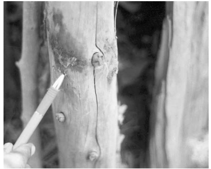
Fig. 3. Scent-marking site on a fencing stump with smooth surface in human settlement area in Suba village. The secretion adhered on the surface of the sign-post is shown with a pointer.

Civets were observed to re-mark the sites from where the glandular secretion was removed. It was not established whether removing the civet musk stimulated an increase in the frequency of scent-marking (re-marking). No obvious difference was ob-