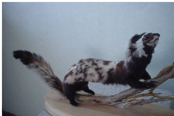
Fig. 3. Marbled Polecat specimen housed in the collection of Uvs aimag Strictly Protected Area museum.