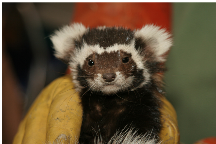
Fig. 2. Marbled Polecat captured in Ikh Nart Nature Reserve, Dornogobi aimag.

in northern Ikh Nart Nature Reserve, Dalanjargalan soum, Dornogobi aimag, in 2006 (45°46'15"N, 108°38'57"E). We released the animal. Another one of us (R.P.R.) found the remains of a Marbled Polecat in a Cinereous Vulture Aegypius monachus nest in Ikh Nart the previous year (45°41'03"N, 108°35'29"E, 1,200 m elevation). We did not collect these remains.